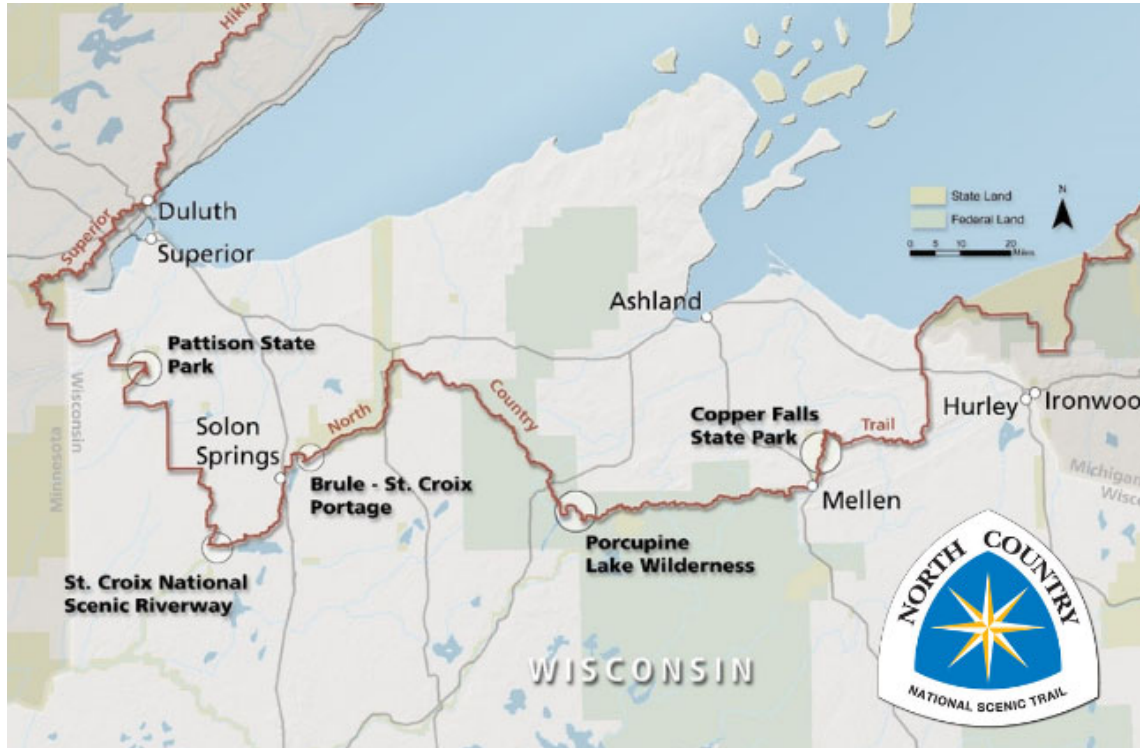
The 4,600-mile North Country National Scenic Trail crosses eight states, 200 miles of which are in Wisconsin. Inspiration for the national trail comes from the 60 mile section in the Chequamegon-Nicolet National Forest, once called the Northern Country Trail.

involvement from its state government agencies. The counties have also been instrumental partners in supporting the trail's development.