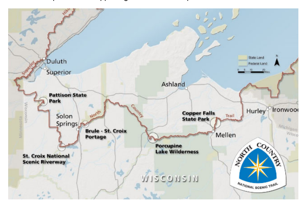
The 4,600-mile North Country National Scenic Trail crosses eight states, 200 miles of which are in Wisconsin. Inspiration for the national trail comes from the 60 mile section in the Chequamegon-Nicolet National Forest, once called the Northern Country Trail.

involvement from its state government agencies. The counties have also been instrumental partners in supporting the trail's development.